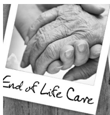
End of Life Care