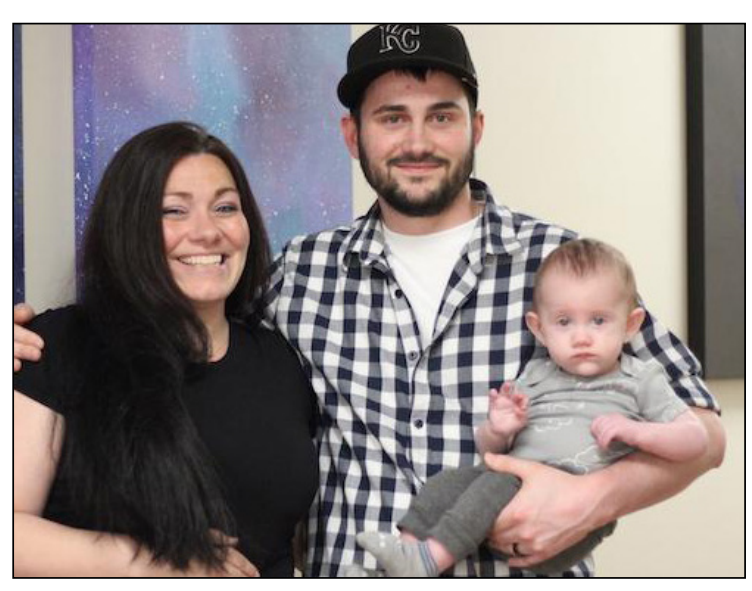
Client and family of AHH.

Every year, the Village Church Mission Committee invites selected nonprofit organizations to apply for Signature Mission funds. This fund, which is generally combined with the Least of These Fund and Mission Legacy Fund from Endowment, provides the monies for a larger than customary gift from Village Church to a community nonprofit. These funds may help start new programs, expand infrastructure, and/or serve new clientele. In general, Signature Mission provides funds to help a local organization grow. It offers an authentic opportunity to encounter Jesus Christ through service work and an identifiable place to grow in relationship with God. The Mission Committee has selected Artists Helping the Homeless (AHH) Johnson County Respite House for this coming year's Signature Mission.