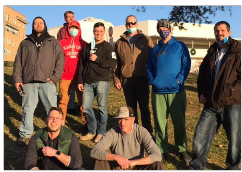
Clients of Artists Helping the Homeless.

The respite house concept was developed to bridge the 4-to 8-week gap between detox and inpatient treatment. A return to the street often meant the $3,000-$5,000 cost for detox was lost along with the person's sense they could make a change. At the respite house, they can continue to progress while waiting to be admitted to another service. AHH respite facilities provide residents a place to clear their minds and make plans and address recovery and multiple coexisting conditions. Shelter, food and basic needs are provided free of cost. Monitored 24/7