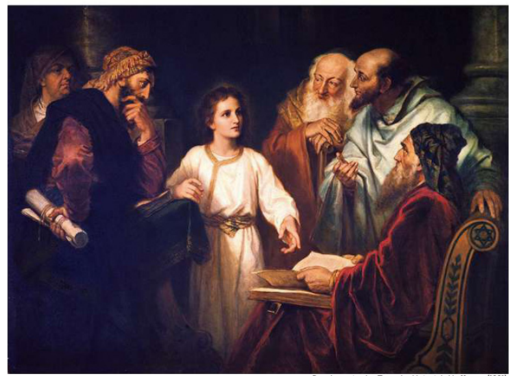
Boy Jesus in the Temple. Heinrich Hoffman, (1881).