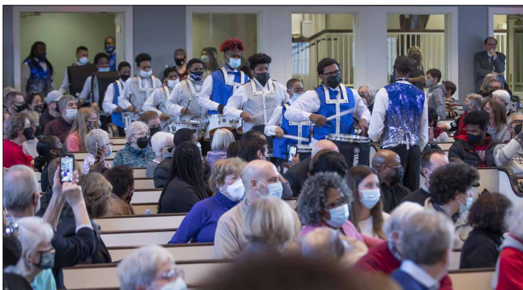
LINC Mighty Wild Eagles