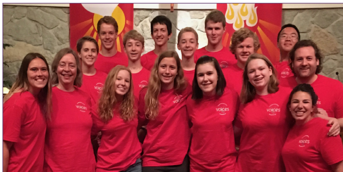
Village Voices Summer Choir Tour